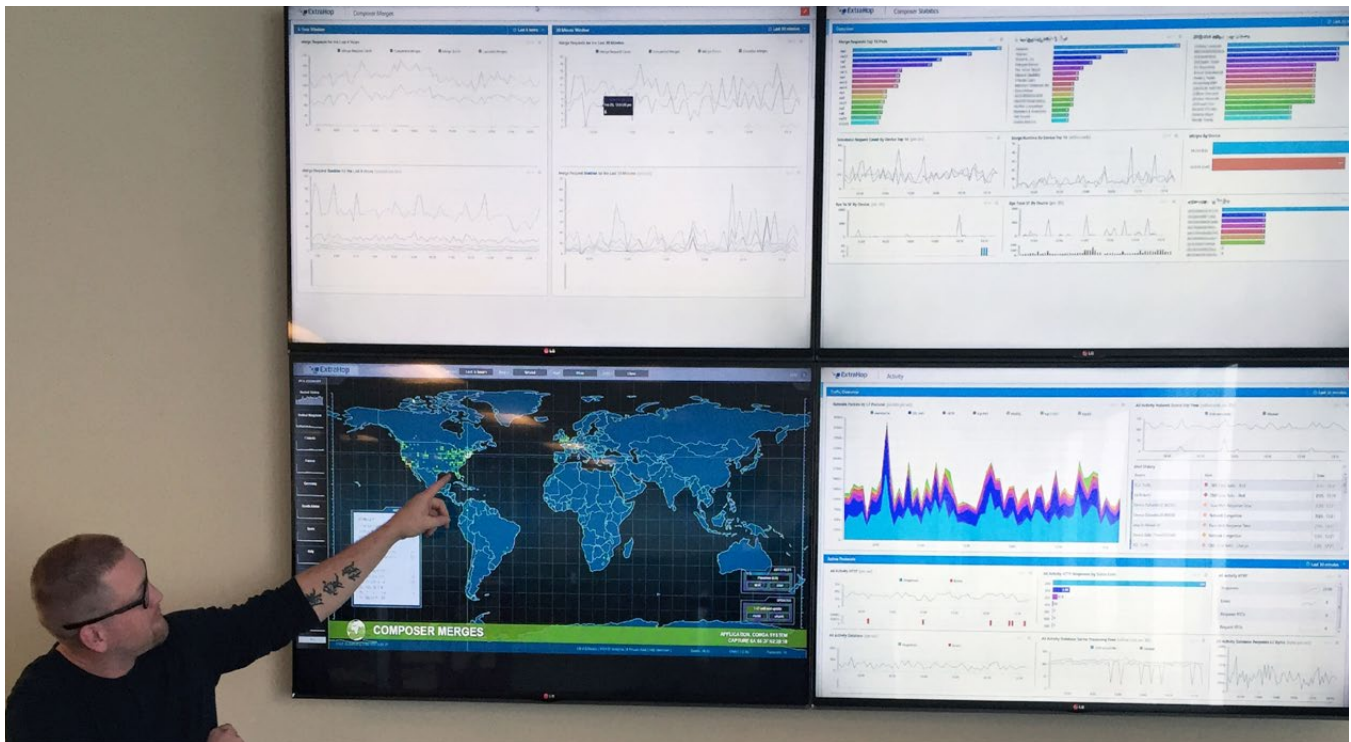
Conga displays ExtraHop dashboards in their office so that they can continuously monitor critical metrics and identify anomalies.