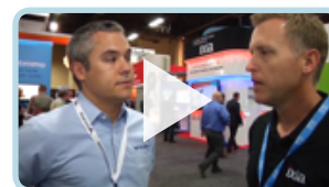
The Ixia and ExtraHop solution

ExtraHop is the leader in analytics and investigation for the hybrid enterprise. We apply real-time analytics and advanced machine learning to every business transaction to deliver unprecedented visibility, definitive insights, and immediate answers that enable security and IT teams to act with confidence. The world's leading organizations trust ExtraHop to support core digital business initiatives like security, IT modernization, and application service delivery. Hundreds of global ExtraHop customers , including Sony, Microsoft, Adobe, and DIRECTV, already use ExtraHop to accelerate their digital businesses. To experience the power of ExtraHop, explore our interactive online demo . Connect with us on Twitter and LinkedIn .