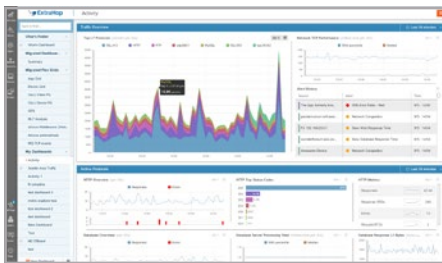
Real-time analysis of application transactions yields valuable metrics to support troubleshooting and decision-making.