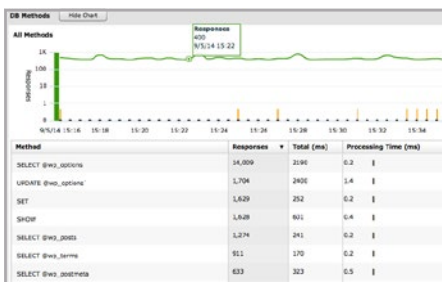
The ExtraHop system extracts transaction-level details in real time, including errors, methods, files, users, and more.